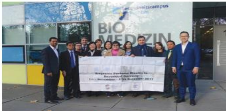
The Singapore delegation at Health Campus Bochum, Germany.

On the fourth day, arrangements were made to bring the delegation to visit the Health Campus Bochum (HCB) and the Health Region Cologne-Bonn . The delegates gave their presentation and in-depth discussion was held on how the host medical technology companies can collaborate with the Singapore healthcare and medical companies.